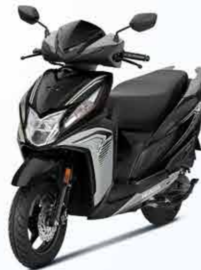
PEARL DEEP GROUND GRAY (STRIPE)