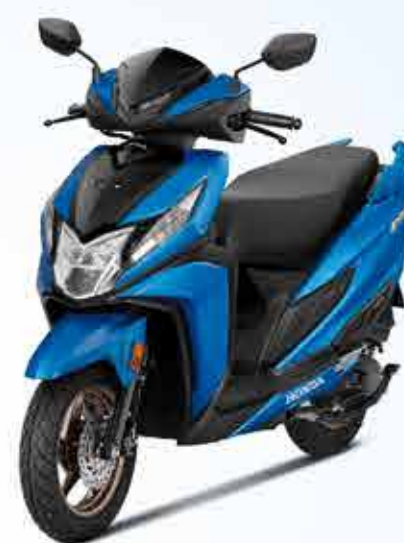
MAT MARVEL BLUE METALLIC