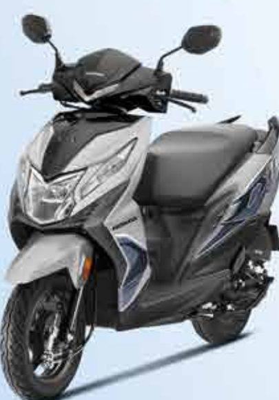
PEARL IGNEOUS BLACK + PEARL DEEP GROUND GRAY