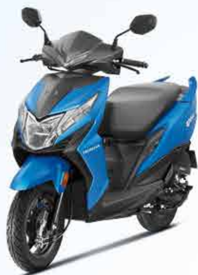
MAT MARVEL BLUE