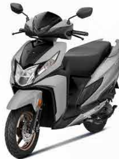
PEARL DEEP GROUND GRAY (EMBLEM)