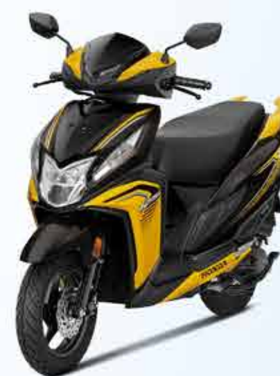
PEARL SPORTS YELLOW